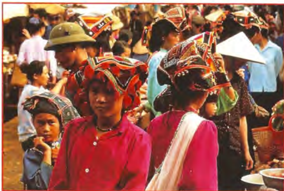
Black Thai village market—northern Vietnam

On the 17th September 1995, this project set off with great excitement and trepidation in search of a viable route from Vietnam to the upper source of the Mekong and Tibetan Plateau. The eight week itinerary offered a great contrast of culture, scenery and climate with added bonuses of delicious food, beaches and an incredible welcome throughout.