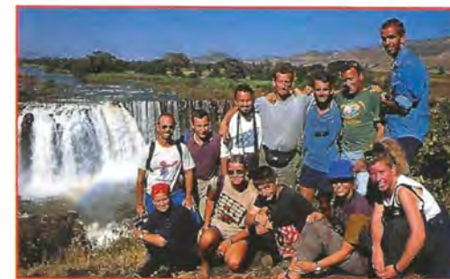
Tisatis Falls, Ethiopia, Dec. 95

Nairobi—Addis 1996 26 Oct—22 Nov Addis—Nairobi 1997 16 Feb—15 Mar