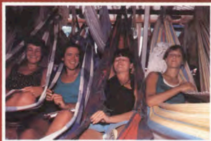
The tough have a rest!