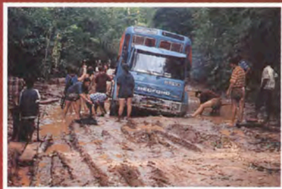
& when the going gets tough...