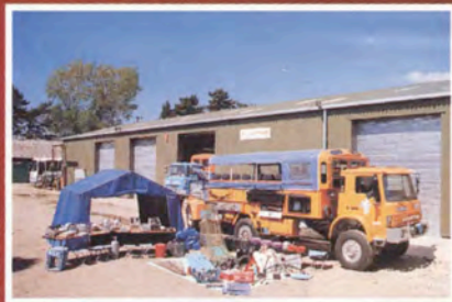
Built for the job...