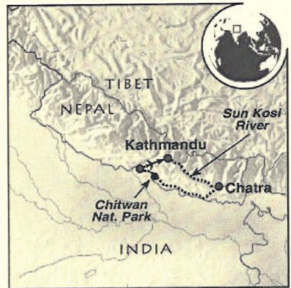
SUN KOSI: RIVER OF GOLD

This project is a combination of the 'Sun Kosi: River of Gold' 10 days, and the 'Upstream to Everest' 28 day projects, but does not include Chitwan National Park . They link up in Chatra so you could be travelling with people who are taking part in either of these projects. This is the ultimate challenge, for full information please request dossiers SKR and UEV .